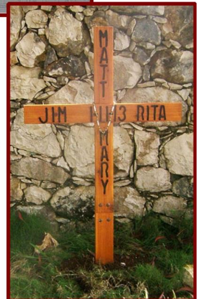
Cross made in USA and now located in Seguin