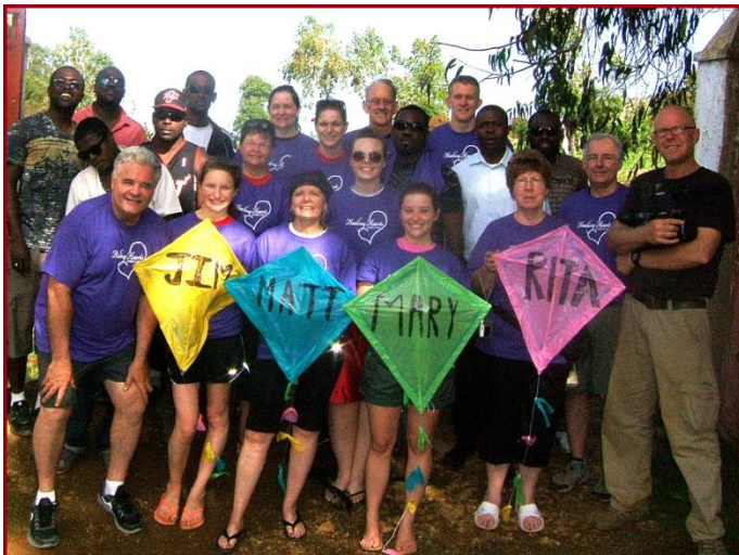
June 2013 Medical/Dental Team

A benefit was held in February to cover funeral expenses and to contribute to memorial funds for our four dear friends. Once again the outpouring of support was evident for the families, the team members, and the community.