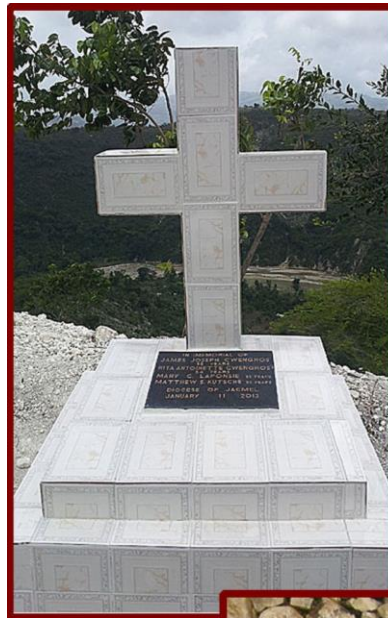
Cross built at the accident site by the people of Seguin